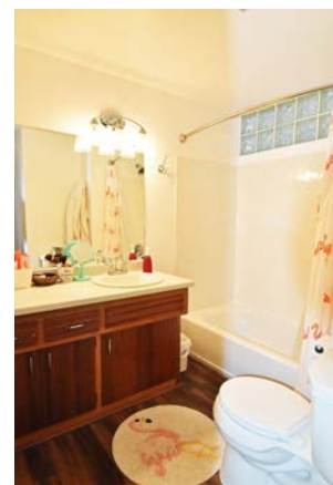
Full bath by Bedroom 3