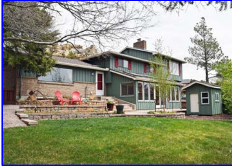
2518 Pine Bluff Road, Colorado Springs, CO 80909

Fabulous 3 bedroom, 4 bath, 2-car garage tri-level on private cul-de-sac with almost 1/3 acre of tasteful, mature landscaping near Palmer Park. Excellent condition—well maintained—and no homeowner association. Stop looking because you are home! Offered at only $468,900! Lets take a tour: