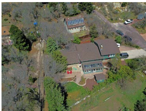
Your new home!